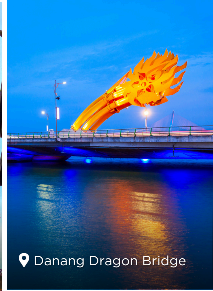
📍 Danang Dragon Bridge