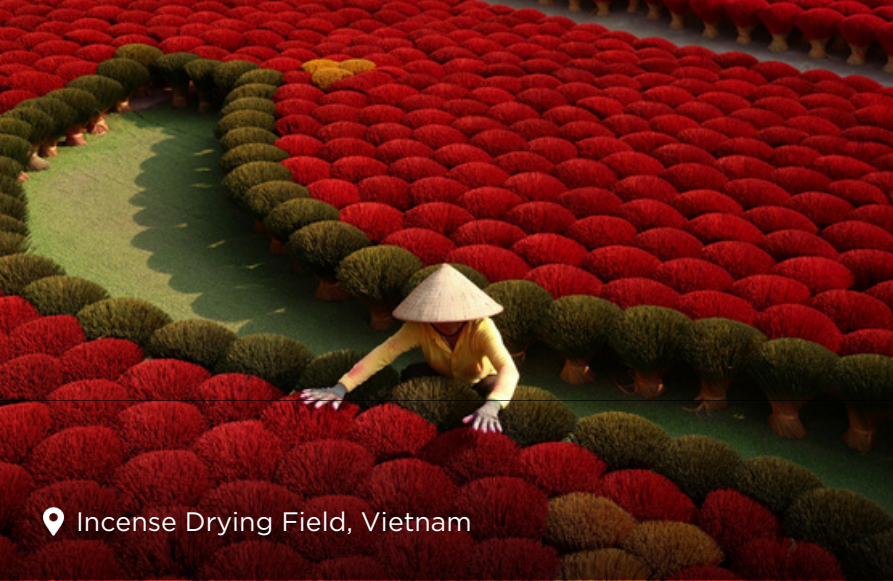
📍 Incense Drying Field, Vietnam