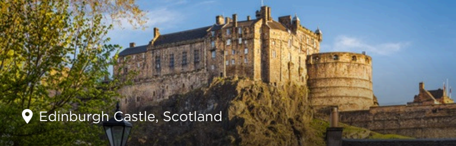
📍 Edinburgh Castle, Scotland