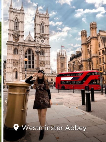
📍 Westminster Abbey