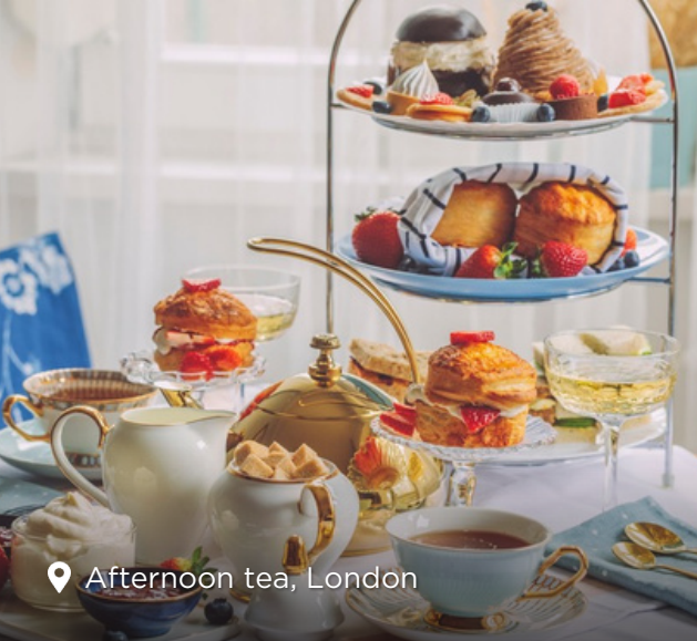
📍 Afternoon tea, London