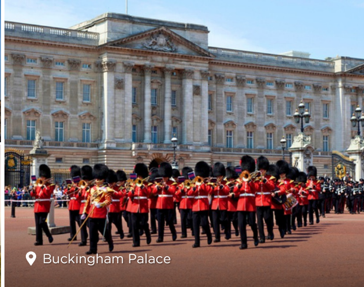
📍 Buckingham Palace