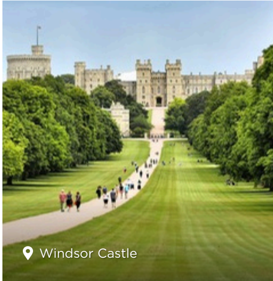
📍 Windsor Castle