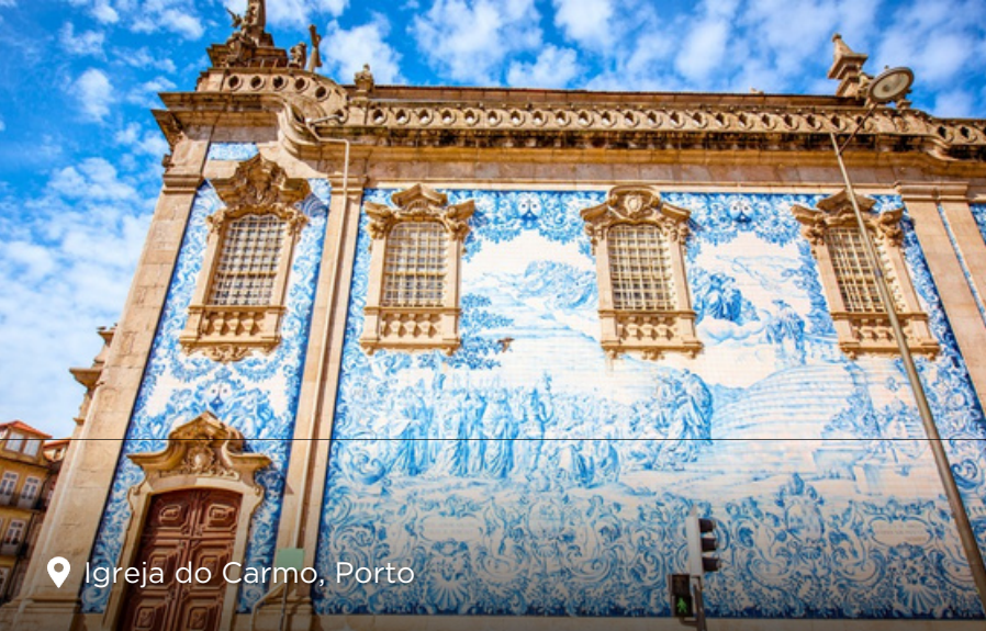
📍 Igreja do Carmo, Porto