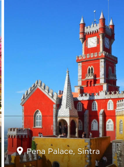
📍 Pena Palace, Sintra