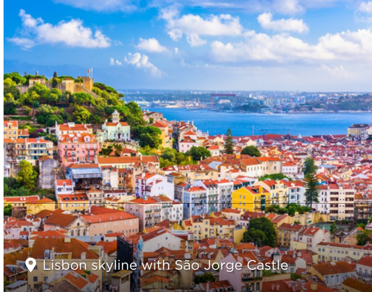
📍 Lisbon skyline with São Jorge Castle