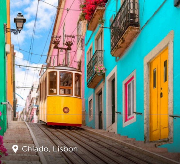
📍 Chiado, Lisbon