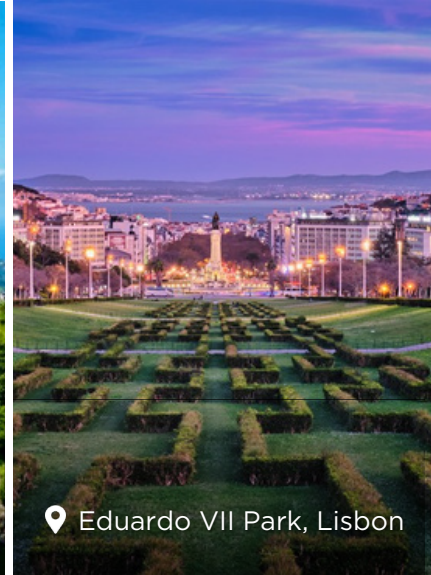
📍 Eduardo VII Park, Lisbon