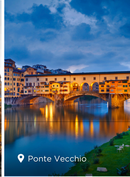
📍 Ponte Vecchio