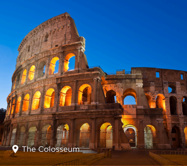
📍 The Colosseum