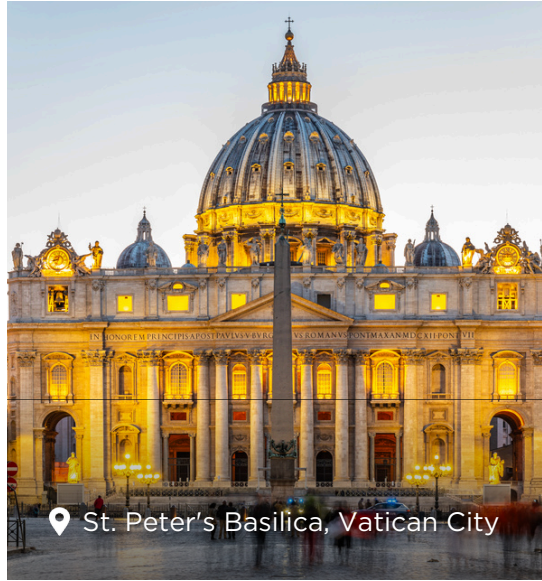
📍 St. Peter's Basilica, Vatican City