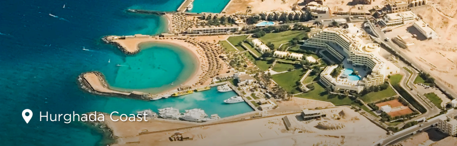
📍 Hurghada Coast