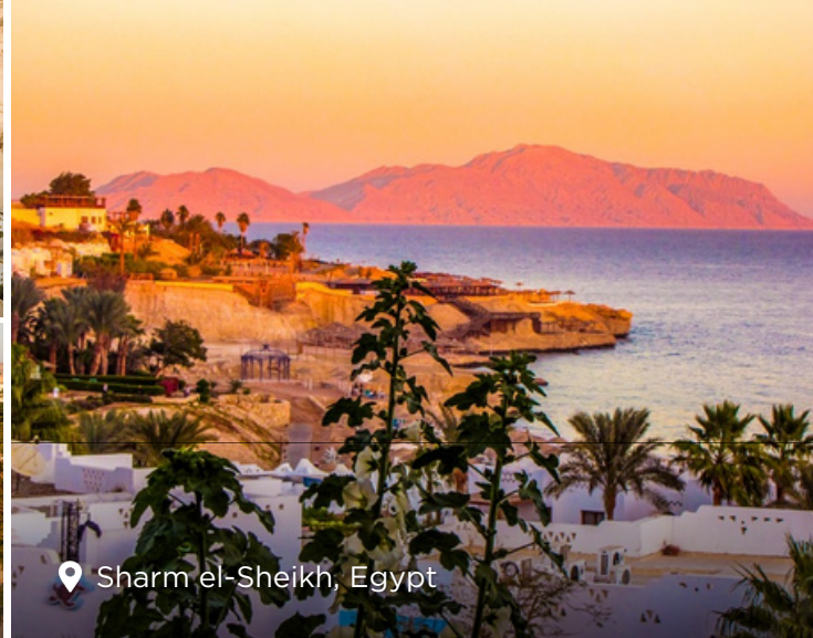
📍 Sharm el-Sheikh, Egypt