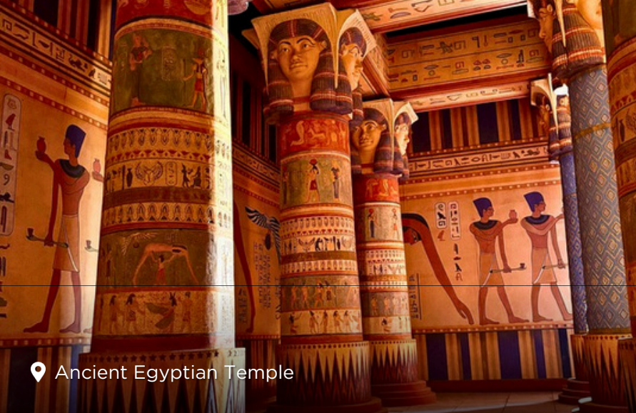
📍 Ancient Egyptian Temple