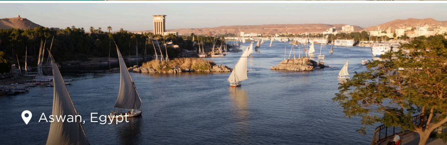
📍 Aswan, Egypt