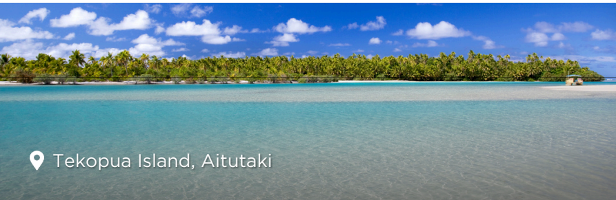
📍 Tekopua Island, Aitutaki