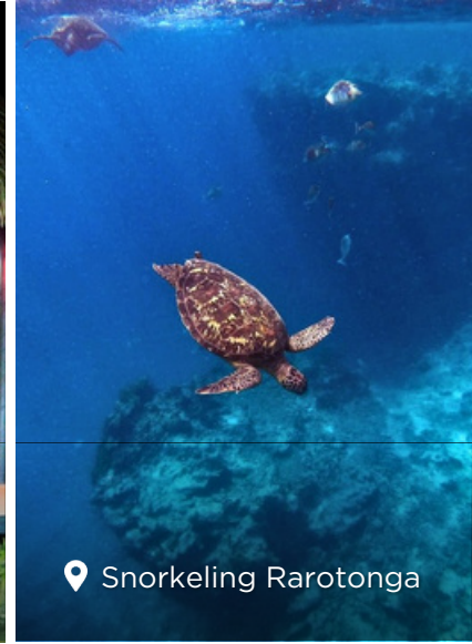
📍 Snorkeling Rarotonga