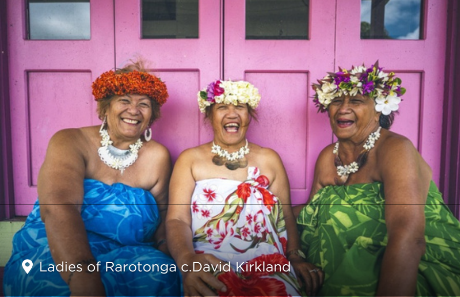
📍 Ladies of Rarotonga