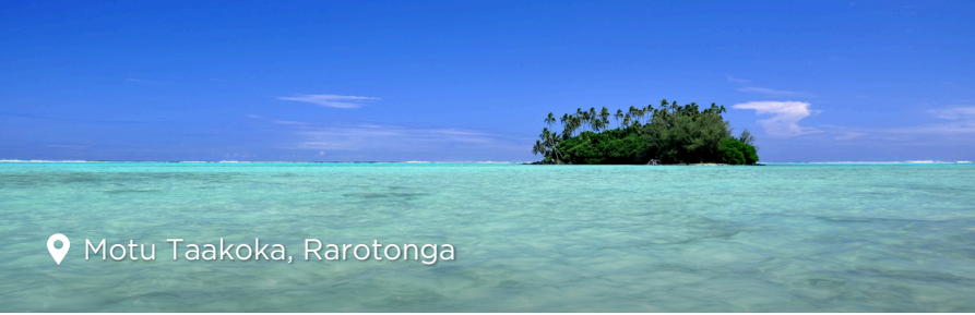
📍 Motu Taakoka, Rarotonga